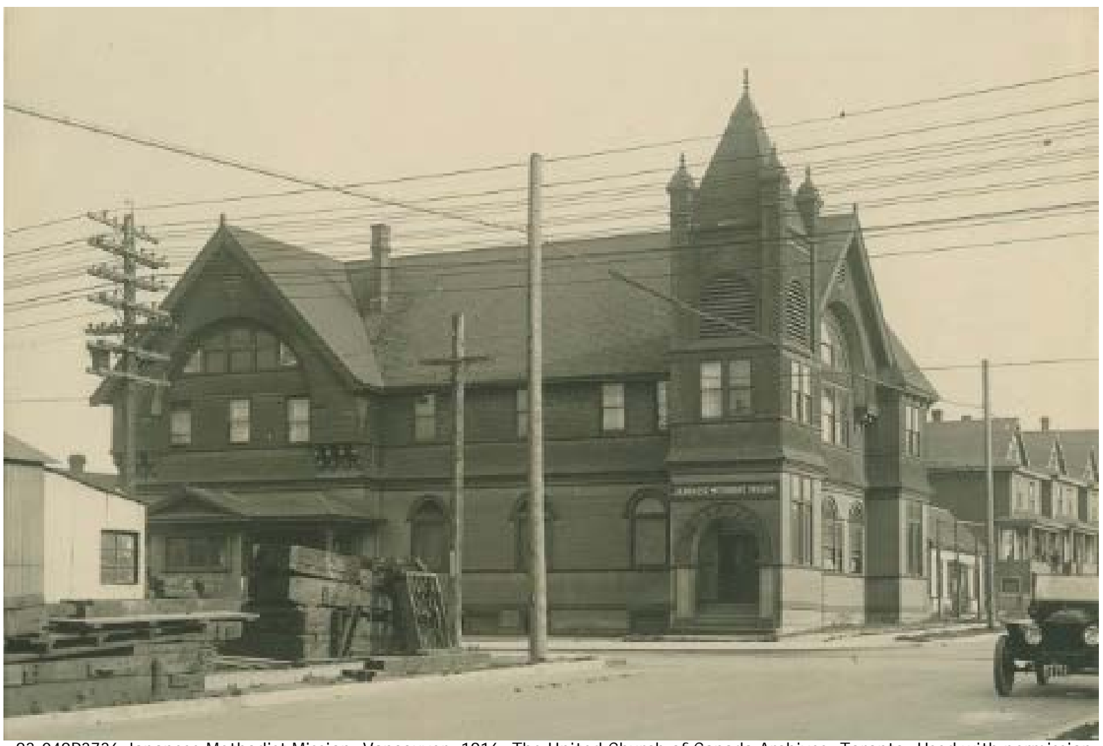
93.049P3736 Japanese Methodist Mission, Vancouver, 1916.