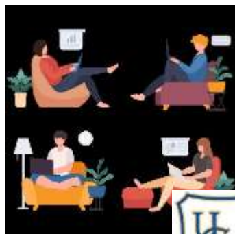
Royalty Free Image: Meet Virtually