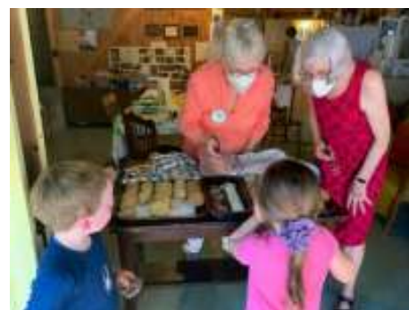
On Right: Children choose cookies with the help of volunteers at The UCW Cookie Cottage – Berwick United Church Camp, NS