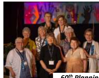
60 th Planning Committee Maritime UCW

$6 each postage included. Pins will also be available for purchase at the Maritime Annual meeting at Visions United in Moncton, NB April 28 th . -