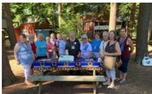
On Left: Smiles and Cake are served!

As part of this special day, UCW ladies gathered in the outdoor pavilion, surrounded by majestic hemlock trees, to share an afternoon of worship, singing, and a presentation of the happenings at the 60th anniversary celebration of the UCW, held in Sydney last July. Following the presentation, the ladies gathered for a celebratory Cake Cutting.