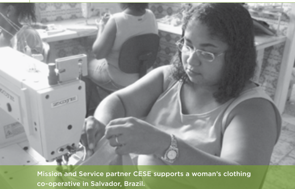
Mission and Service partner CESE supports a woman's clothing co-operative in Salvador, Brazil.

*Your M&S donation is combined with additional donated funds, including the Morrison Bequest fund, Emergency Fund donations, grants from trusts and endowments, designated gifts, investment income, and government co-financing.