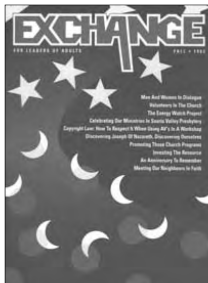
This article first appeared in the Fall 1993 issue.

The Bible study process presented here was shaped by some observations concerning men. (They are merely observations and are not indicative of every man's experience.) The first observation is that men are hurting. The hurt they are feeling is very broad and takes form in many ways. It may be grief over